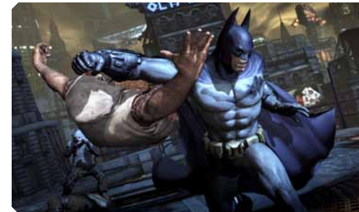
Tons of challenge maps exist for those adept at creative stealth takedowns and beating criminals senseless.

Charge gun from the shadows to force an enemy's gun to fire, frightening nearby guards. We also manipulated everything in our environment to pick thugs off one by one: Floor grates, breakable walls, and ceiling perches were all viable tools for instilling fear in the hearts of our foes.