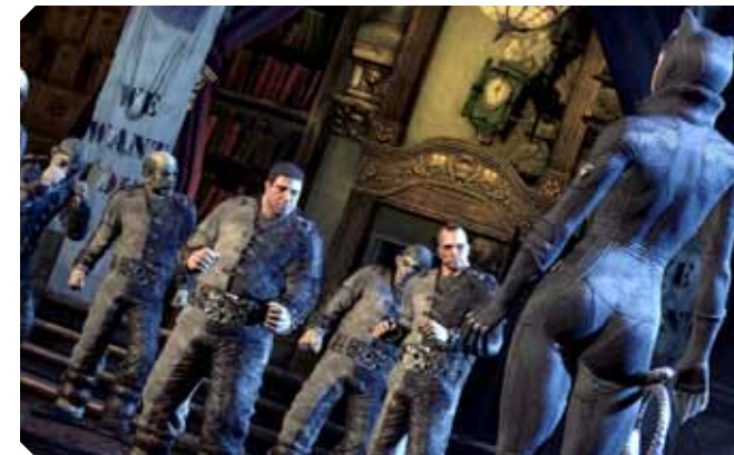
Controlling Catwoman and employing her cat-tastic gadgets is an entirely new (and fun) experience.

Strange plants the seeds of insecurity in the Caped Crusader's head: Would villains such as the Joker even exist if it weren't for Batman? Can Wayne hope to put an end to the corruption within Arkham City? The Dark Knight's self doubt makes him more relatable as a character, which in turn made us more deeply invested in his quest for justice. The city itself is meticulously detailed. Search lights point menacingly in every direction. Graffiti marks each dilapidated building. The colorful backdrop of Gotham's distant city lights serves as a constant reminder of the decay stagnating before us. The simple act of exploring the expansive compound's grisly open-world interior is an exhilarating experience, though never overwhelming. Getting around from building to building is easy thanks to the Grapnel gun, but we had even more fun